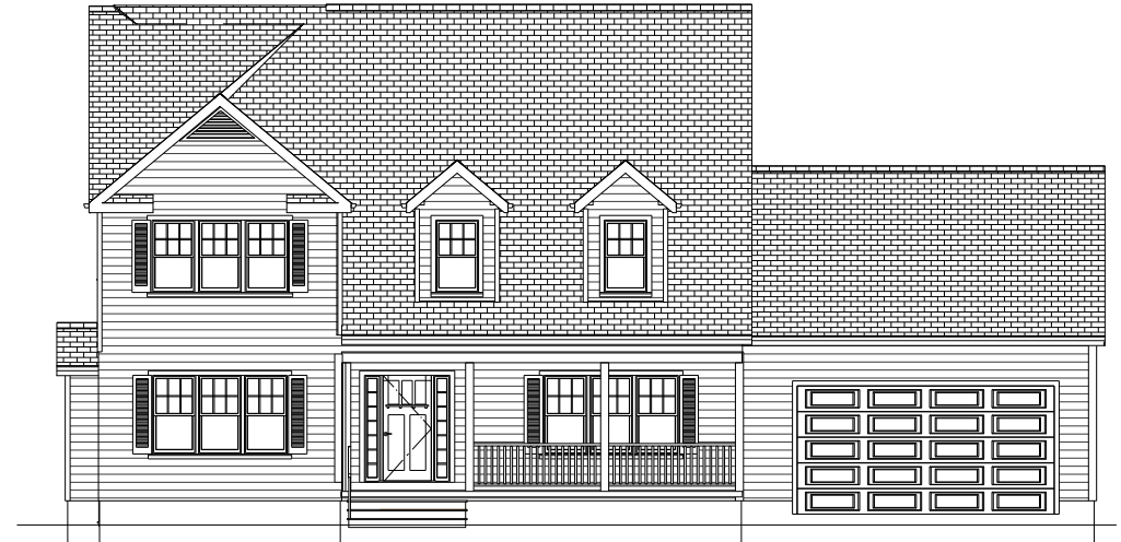
Exterior Elevation Front

NOTE: THESE PLANS & ELEVATIONS ARE SCHEMATIC & ARE SUBJECT TO MINOR CHANGE. SOME OPTIONS/UPGRADES ARE SHOWN.