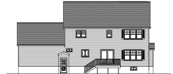
Exterior Elevation Back